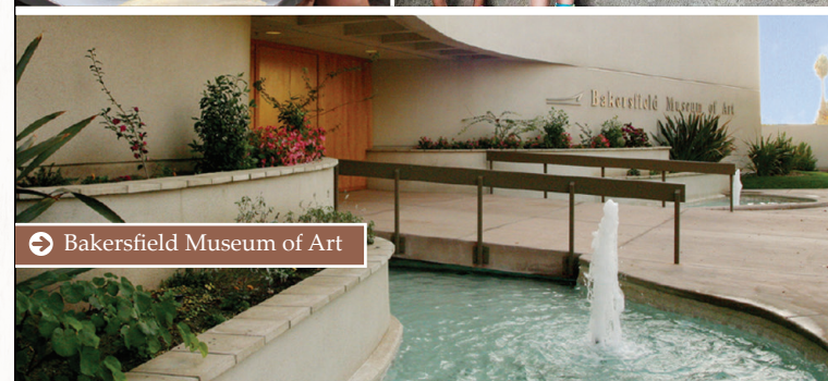
➔ Bakersfield Museum of Art