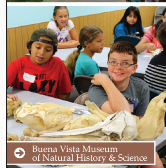
➔ Buena Vista Museum of Natural History & Science