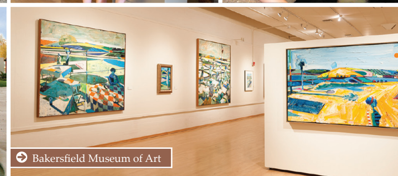
➔ Bakersfield Museum of Art