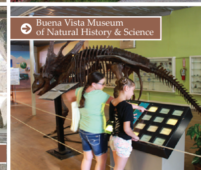
➔ Buena Vista Museum of Natural History & Science