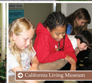
➔ California Living Museum