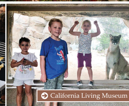
➔ California Living Museum