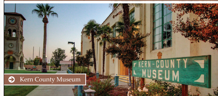
➔ Kern County Museum